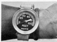
Fig. 209. Diver's wrist depth gauge

Diver's Spirit Level mounted on heavy base, with 2-foot rule with raised figures, so that diver can take measurements visually when working in clear water, or by sense of touch when in darkness.