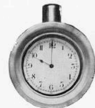
Fig. 212 Diver's wrist watch with luminous dial, in watertight case