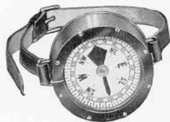
Fig. 210 Diver's wrist compass (luminous)